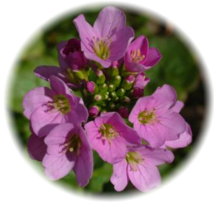
Wild flower essences lovingly made by hand in the Lake District